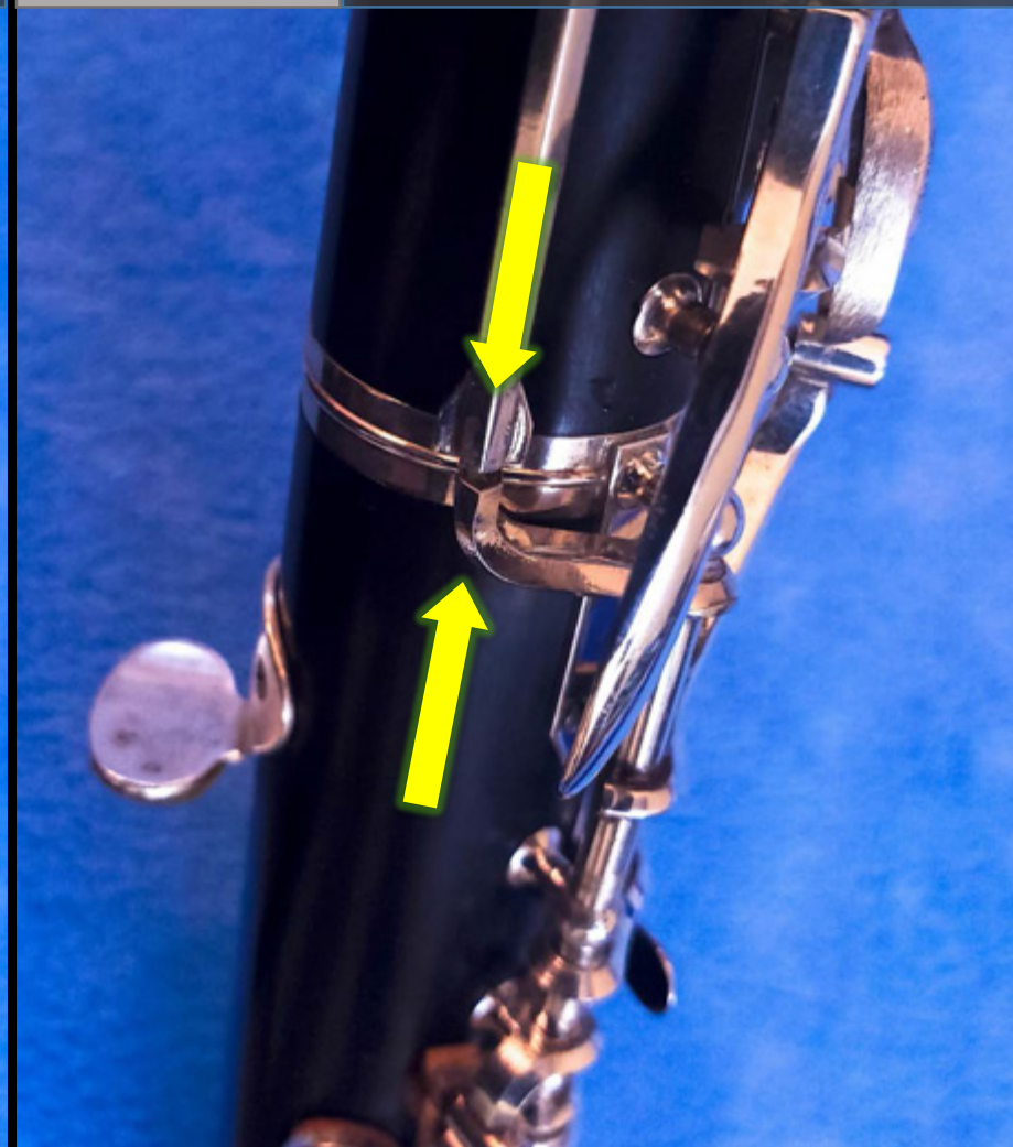
Bridge points aligned

Complete the alignment. The bridge key on the opposite side should now also be aligned.