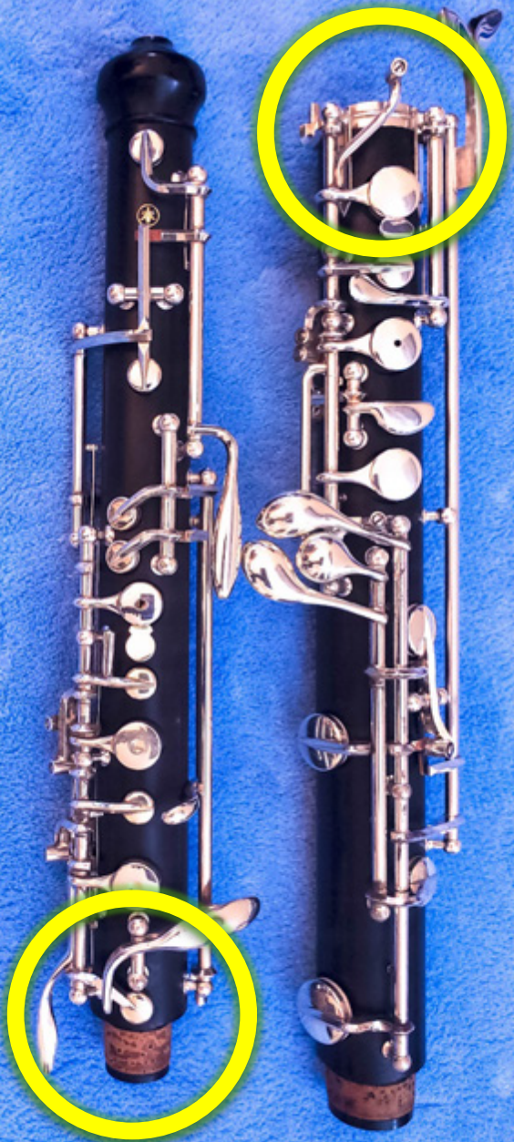
Proper Bridge Alignment