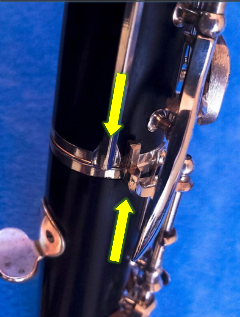
Bridge points misaligned

Align the pictured bridge key, this will serve as reference for the alignment of both bridge points.